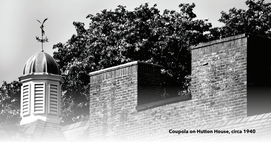
Cupola on Hutton House, circa 1940

Support Hutton House: We rely on donations to bring you stellar programming and faculty. We ask that you consider making a gift to Hutton House Lectures at liu.edu/donate or call 516-299-2580.