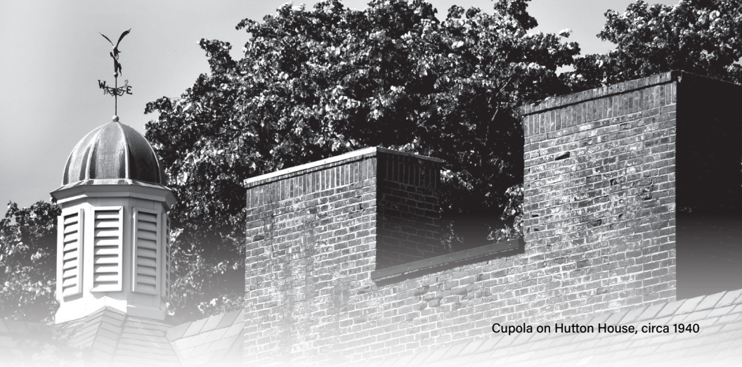
Cupola on Hutton House, circa 1940

Support Hutton House: We rely on donations to bring you stellar programming and faculty. We ask that you consider making a gift to Hutton House Lectures at liu.edu/donate or call 516-299-2580 .